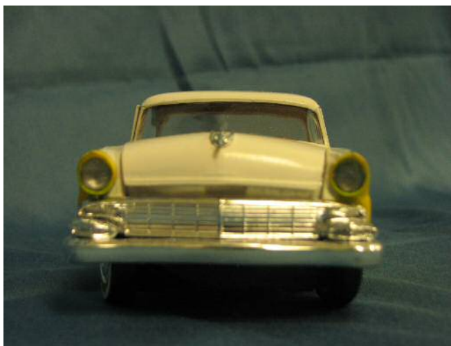
TABLE FULL OF MODELS ....(well not really).